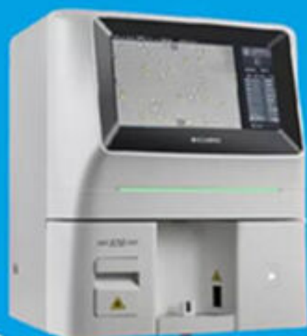
COBIO ® S50 Automated Urine Sediment Analyzer