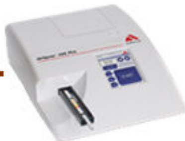
Analyticon Urilyzer 100 PRO